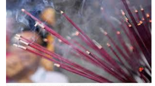
KVIC's Khadi Agarbatti Atmanirbhar Mission (KAAM) 2020